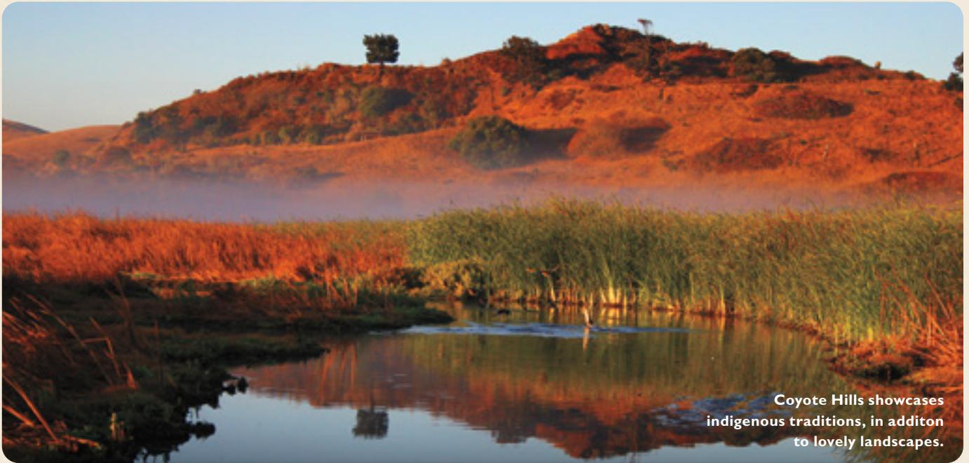
Coyote Hills showcases indigenous traditions, in addition to lovely landscapes.

Round Valley Regional Preserve or Brushy Peak Regional Preserve. There is a new Foundation-supported effort to provide buses for underserved communities who have historically been unable to get to Vasco.