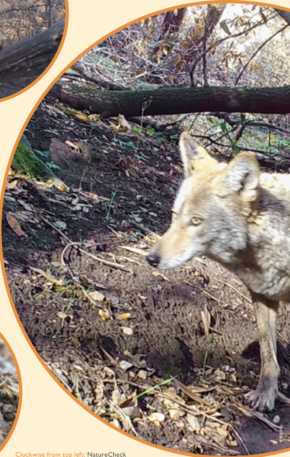
Clockwise from top left: NatureCheck assesses the health of local wildlife population such as mule deer, coyotes, golden eagles, savannah sparrows, western burrowing owls, California tiger salamanders and bobcats.