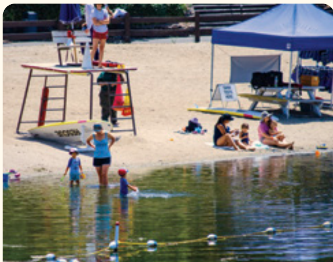
Clockwise from top left: A rendering of the pool renovation at Roberts Regional Recreation Area; a wealth of swim opportunities can be found at parks throughout the District.