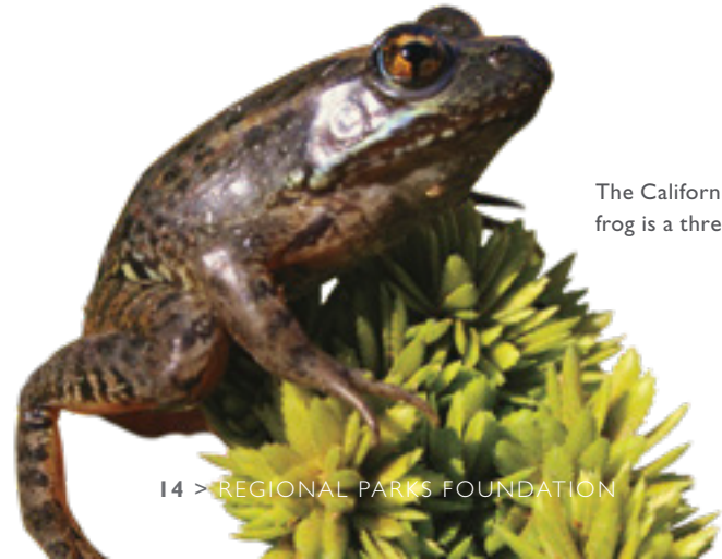
The California red-legged frog is a threatened species.

In May 2018, representatives from the five agencies sat down together to determine which animal species to assess and what metrics to use. They identified key bird, mammal, fish, amphibian and reptile species that are indicators of the health of the environment, as well as iconic species of interest to the public. One of the keystone species selected was California ground squirrels. Not only do their tunnels provide habitat for native amphibians and western burrowing owls, they’re also an important prey species for coyotes and