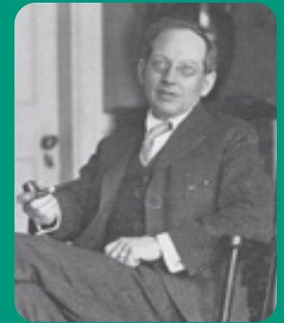
From left: A 1934 look at the proposed East Bay Regional Park District; Frederick Law Olmsted Jr.