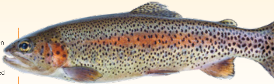
Rainbow trout is an identified indicator species.