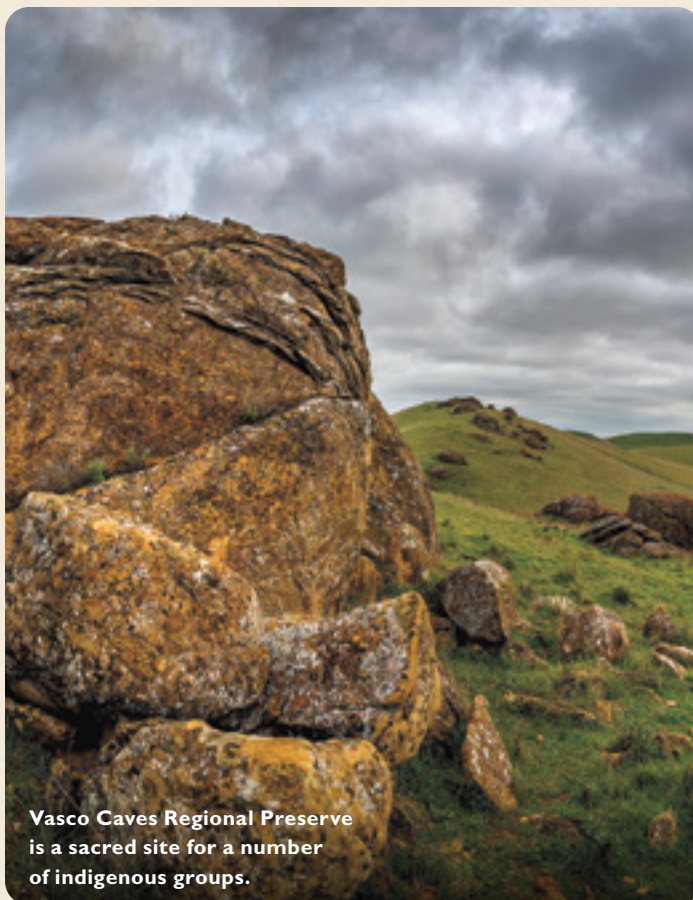
Vasco Caves Regional Preserve is a sacred site for a number of indigenous groups.

One such protected site is Vasco Caves Regional Preserve. The eastern Contra Costa County park is unique because it is open to the public only through limited guided tours. The limited access is partially to care for the area’s endangered species and habitat, but also because Vasco is an active sacred site for many indigenous groups.