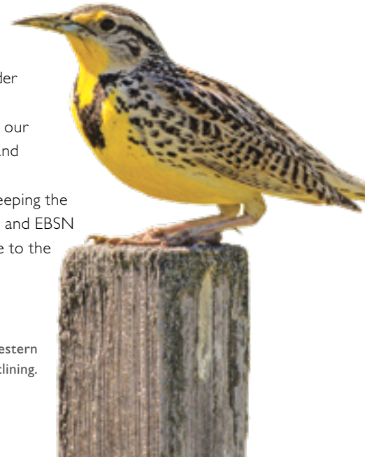
Grassland birds like the western meadowlark are declining.

All of which will be key to keeping the vast acreage of the Park District and EBSN partner lands a welcoming home to the variety of life that inhabits it.